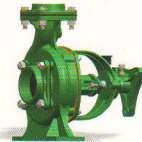
GL2 Gland Pack