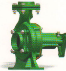
ML Mechanical/Oil Seal